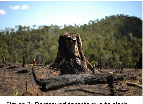
Figure 3: Destroyed forests due to slash and burn agriculture

that the marine and coastal ecosystem is in danger as well, due to deforestation. A huge amount of laterite which is carried by streams and rivers gets into the sea and settles on the Toliara coral reef, located in the Southwest of the country. Furthermore, deforestation can have serious impacts on the climate change as well. Despite the fact that Madagascar is not an industrialized country, thus it does not have a huge amount