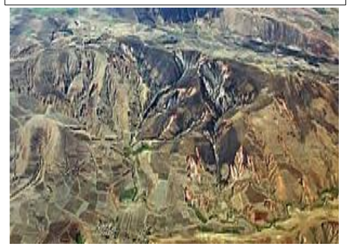
Figure 1: Airplane view of deforestation in Madagascar

surface consisted of many forests, but as time passes these numbers decrease, since nowadays only 17% of Madagascar's immense surface is consisted of forests. Also, it is very important to stress out the fact that Madagascar's fauna is threatened as well, since a lot of rare native animal species such as the lemurs and Ploughshare tortoises are considered to be endangered ones. These environmental issues have risen due to several factors such as but not limited to deforestation, the difficulties the population faces in order to cover all its needs, illegal wildlife trade and last but not least climate change. All in all, it would be important to take into account that the current situation in Madagascar will have a huge impact on the civilians' lives, thus it is crucial to find many effective and implementable solutions in order to address this issue effectively.